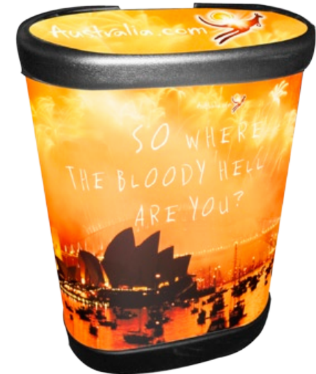
735mm High x 1760mm Wide